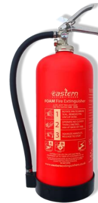
Eastern High Performance P50 Foam Extinguisher