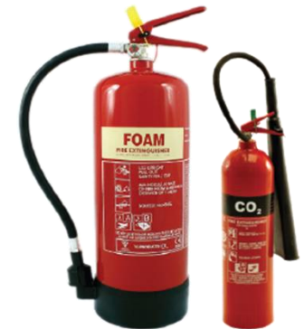
Standard Foam & CO2 Extinguishers